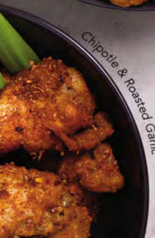
Chipotle & Roasted Garlic