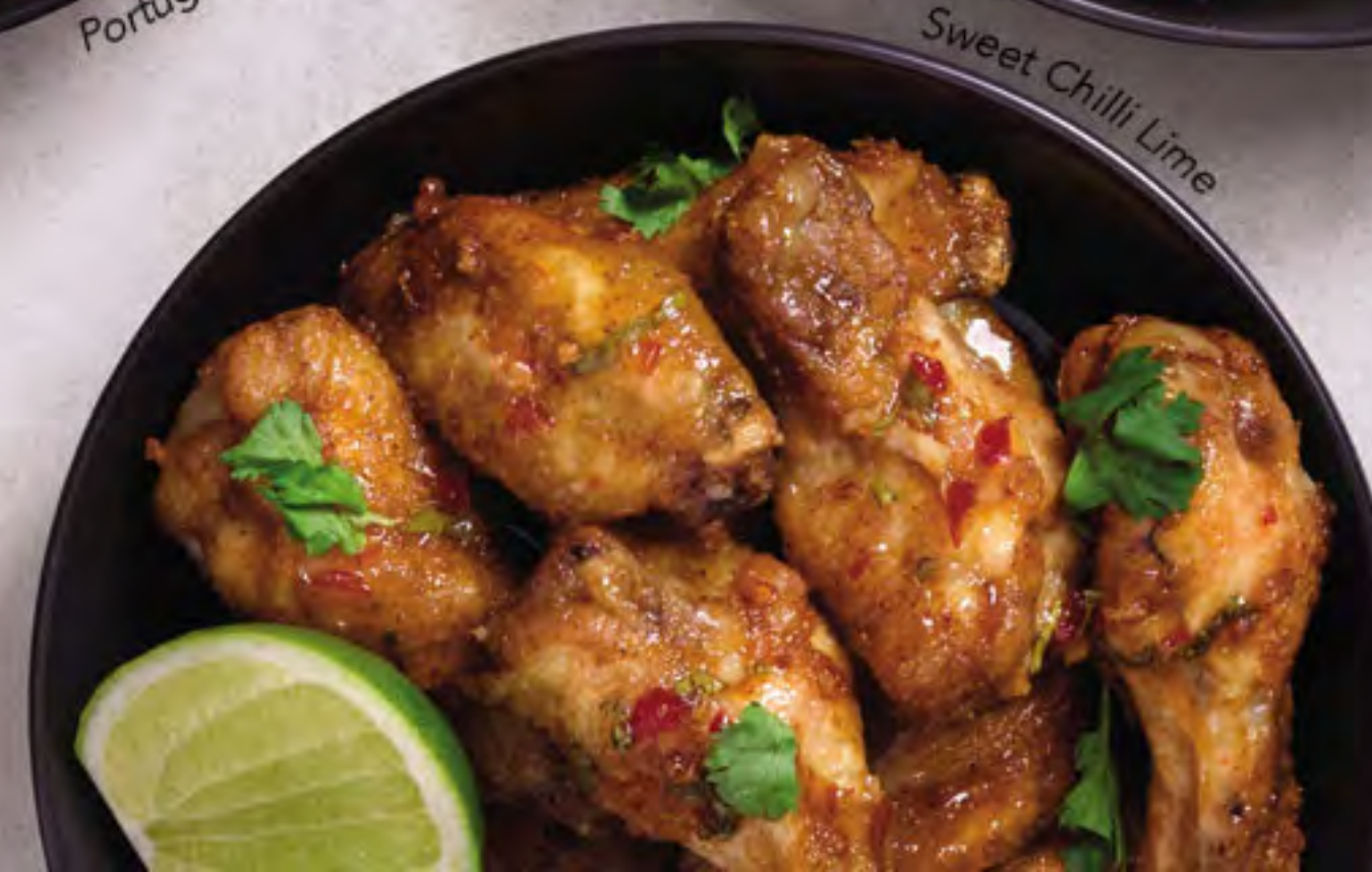
Sweet Chilli Lime