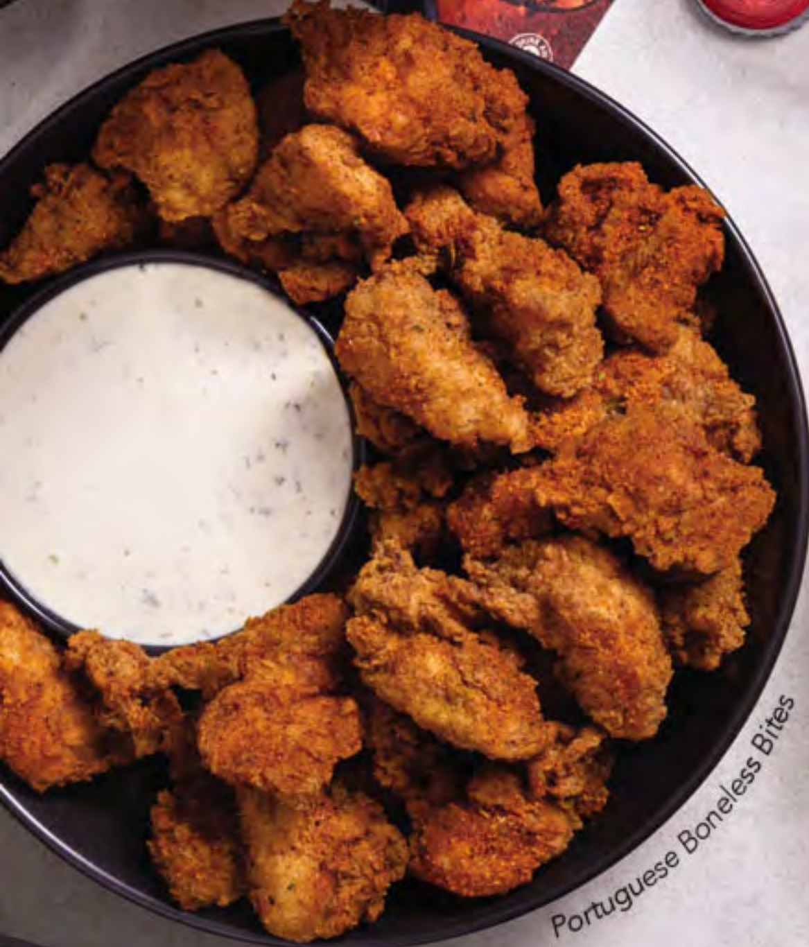
Portuguese Boneless Bites